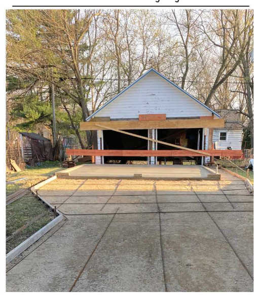
Garage slab poured; rebar laid for driveway pour