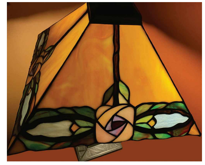
Bedside lamp, Art Nouveau's relaxing glow

Poët's work resembles sleuthing more than what we'd normally think of as a lawyer's work. (I was reminded several times of Miss Scarlett and the Duke. Both protagonists rely on the credentials of a respected, professional man to stay active.) Poët will no doubt persevere in future seasons if Netflix renews the series.