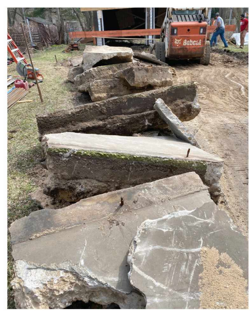
Rubble from the deconstructed garage floor

So anyway, the day after tomorrow (as I type), April 17, is the date which was supposed to be the start date for the garage project, but we are already a week into it. A huge amount of work has been done. In addition, we've been told to expect savings on the original estimate because we donated wood to the project (stuff stored in the garage attic that we had no use for), and because moving the garage, rather than just lifting it, made some things much easier and faster to do. In summary, so far, this job is taking less time, and costing less money than we expected, which goes against all the rules of home ownership. That's fine with us.